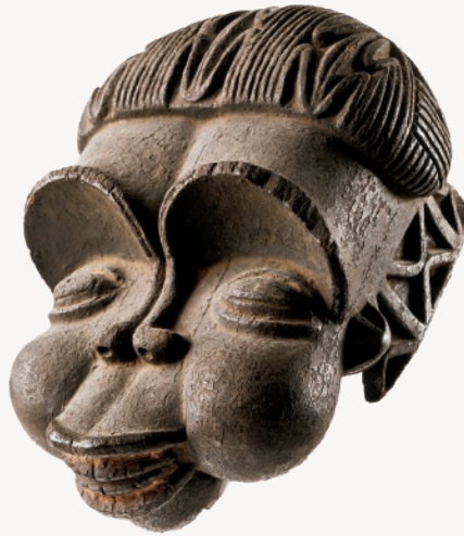
FIG 3 Mabuh Headdress of Kwifon , late 19th to mid-20th century. Possibly Aghem (Wum), Kom, or neighboring peoples. Cameroon, Grassfields, North-West region. Wood; 13 × 10 ½ × 7 in. (33 × 26.7 × 17.8 cm). The Menil Collection, Houston

With its split nose ridge, ballooned cheeks, and other expressive features, the mabuh headdress (FIG 3) can be stylistically attributed to the North-West region of the Grassfields although it was reportedly collected much farther south in Bansa. Motifs of frogs and spiders that reference local mythologies, proverbs, and divination practices make up the pattern of its hairstyle. Mabuh are "runners" who announce the public decrees of kwifon and warn audiences about the arrival of more perilous masked agents such as the felingang group of kwifon . Dressed in body-length tunics, often covered in dark feathers, mabuh move through town streets and ceremonial grounds wielding spears and batons. Occasionally they perform amazing, otherworldly feats. It is an active tradition; communities regularly record performances of mabuh and other headdresses with their mobile phones and other devices to share with members of the diaspora through their social media networks.