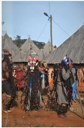
FIG 5 Headdress Representing a Buffalo ( nyatti ), early 20th century. Duala peoples. Cameroon, Littoral region. Wood, paint, and metal; 29 \frac{7}{8} in. (76 cm) long. © Barbier-Mueller Museum, Geneva. Photo: Studio Ferrazzini-Bouchet FIG 6 Hervé Youmbi, Field Photograph , April 7, 2022. From Bamileke-Duala Nyatti Ku'ngang Mask , 2019. No. VII from the series Faces of Masks (Visages de masques) . Pigment print; 19 × 15 in. (48.3 × 38 cm). Courtesy of the artist and Axis Gallery, NY. © Hervé Youmbi

with buffalo and cow headdresses in the Grassfields ( FIG 5 ). Despite mixing different traditions and styles, ku'ngang associations in Fondanti and Bakoven Meka ( Bafang ) accepted and ritually initiated the mask. For Youmbi, masks from the Visages de masques series generate new meanings as they move from one context to the next. His installations therefore include evidence of the objects' life experiences, such as ethnographic films and field photographs of the ritual activation of the masks, and related shipping manifests, certificates, and other official documentation ( FIG 6 ).