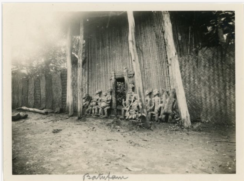
FIG 1 View of tchimla building, with commemorative royal sculptures, Batoufam royal compound, ca. 1925. Photo: Frank H. Christol. Musée du quai Branly-Jacques Chirac, 1998.III.10

In the mid-1920s, French missionary Frank Christol photographed these statues and several others staged at the entrance to a palace building in Batoufam (FIG 1). They appear ceremonially painted with spots, remnants of which are still visible. More than twenty years later, other European visitors to the palace photographed the display (FRONT). Their photographs reveal the continued use of the figures and natural disintegration of the wood over time. They also show how successive rulers commissioned artists to carve new doorframes, support columns, and sculptures to update palace buildings, sometimes replacing objects and architectural elements that were sold to support palace renovations. Artistic patronage for royal courts and international markets continues to shape the identities of Grassfields kingdoms. Today, Batoufam is one of many Grassfields kingdoms that make up La Route des Chefferies, a cultural heritage organization founded in 2006 to support a growing network of regional museums and royal collections.