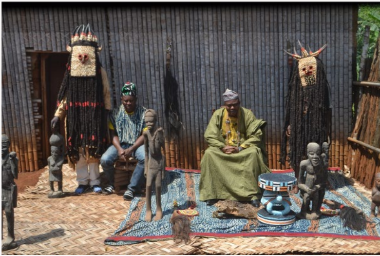
FIG 4 Fon Ngangoum Sylvestre of Balassié Kingdom with beaded tortoise throne by Hervé Youmbi, commemorative sculptures, and members of ku'ngang society wearing yégué masks. Courtesy of Hervé Youmbi

Youmbi's Celestial Thrones ( Les trônes célestes ) consists of five beaded transport thrones that are typical of those commissioned by fon for public appearances and diplomatic visits to other kingdoms. Youmbi's thrones depict zoomorphic analogues ( pi ) for the ruler: panther, buffalo, rhinoceros, elephant, and tortoise. Under the base of each throne, Bamileke proverbs in French have been beaded in reverse to be read in the mirrored pedestals. Three of the thrones are on loan to the exhibition from their majesties Simeu David (Bapa Kingdom), Gabriel Ndjiemeni (Fondanti Kingdom), and Ngangoum Sylvestre (Balassié Kingdom), who received them as gifts from the artist to use in their royal courts ( FIG 4 ). A literal reference to the seat of a ruler's conscience, the imagery and proverbs of the thrones extoll humility, foresight, and the nature of principled leadership.