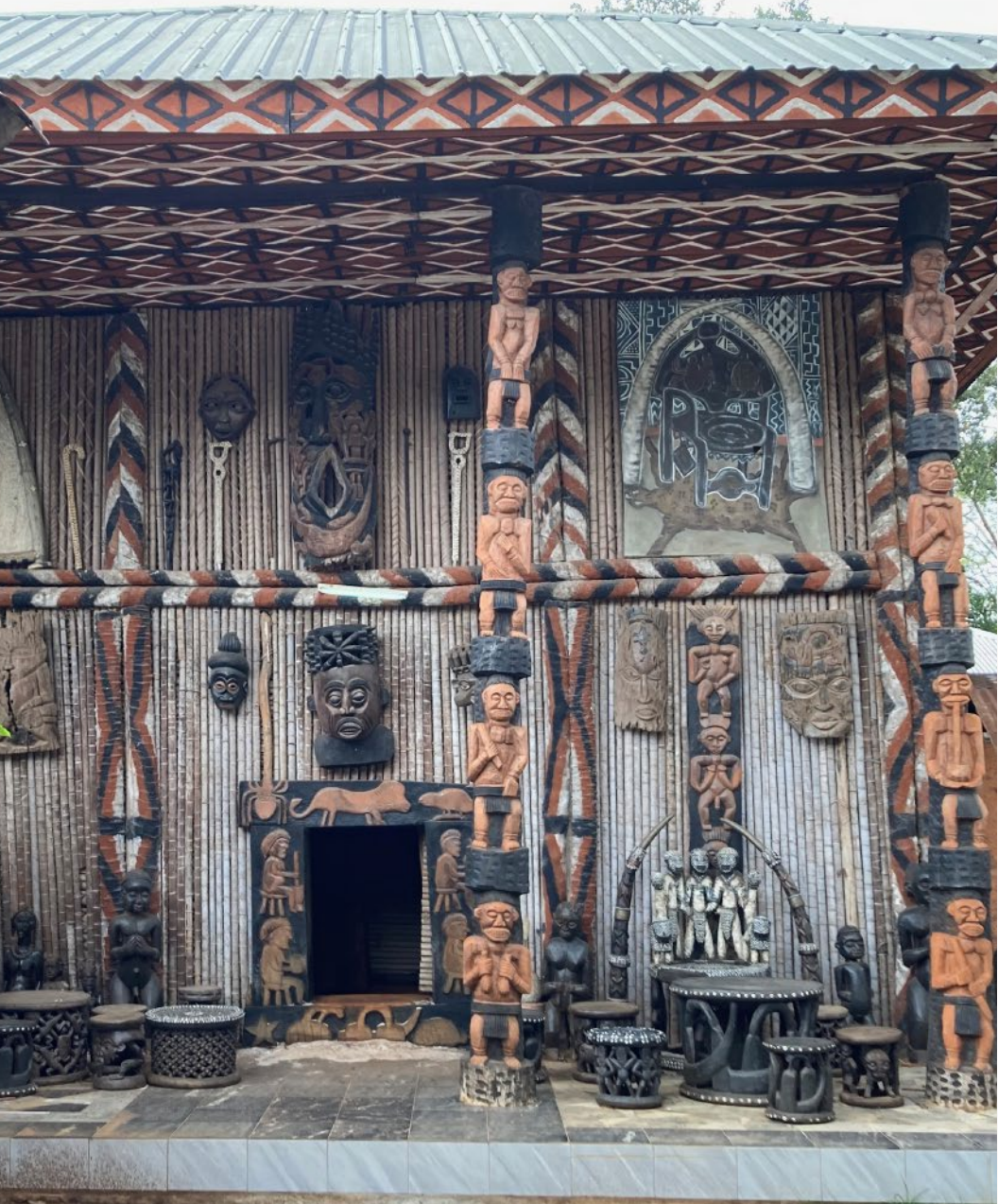
View of building, Batoufam royal compound, 2022.