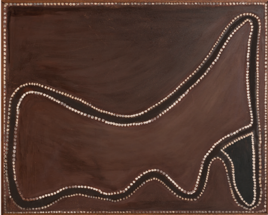
Rover Thomas, Wangkujunga and Kukatja language groups, Ilulunja (Sugar Bag Hill), 1986. Acrylic on wood, 31 ½ × 39 ¾ in. (80 × 100 cm). Fondation Opale, Switzerland.

History, mythological knowledge, and lived experiences are simultaneously present in paintings by Rover Thomas and Paddy Bedford.