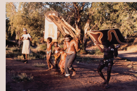
RIGHT Gurrir Gurrir Ceremony, East Kimberley, ca. 1994