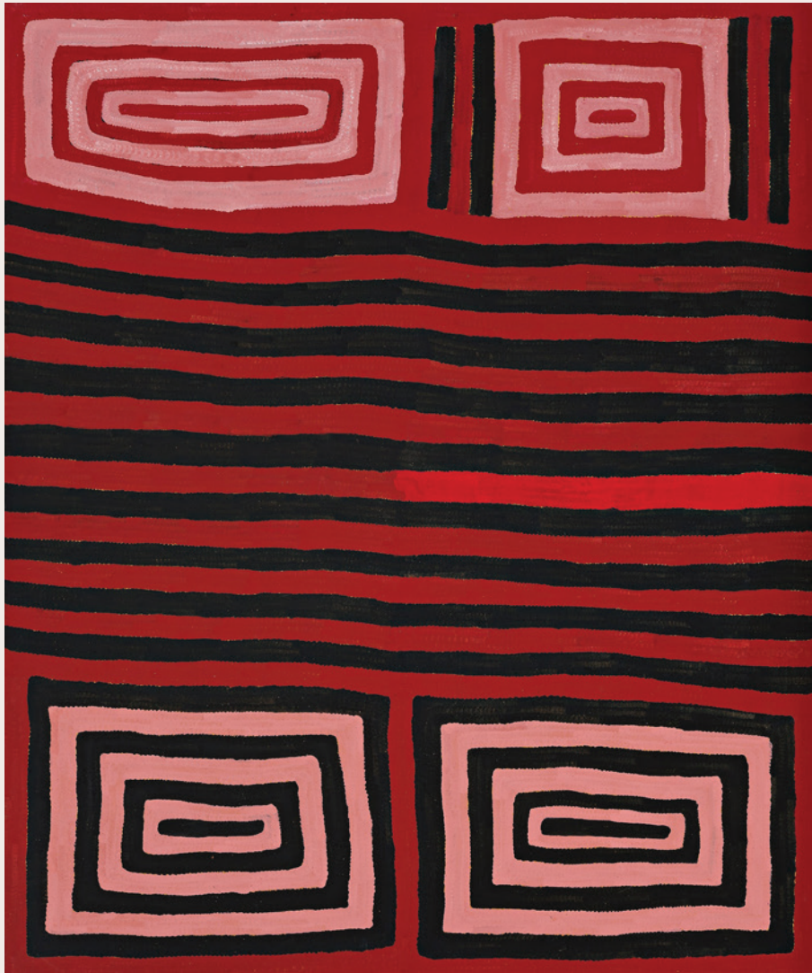
Ronnie Tjampitjinpa, Pintupi language group, Tingari Cycle at a Site Adjacent to Wilkinkarra (Lake Mackay) , 1994. Acrylic on canvas, 72 1/8 x 60 in. (183 x 153 cm). Fondation Opale, Switzerland. © Ronnie Tjampitjinpa / Copyright Agency. Licensed by Artists Rights Society (ARS), New York, 2019.

a series of stories related through dance and lengthy songs that recount the ancestors' creations. These ceremonies initiate new generations—future ancestors—in the knowledge of primordial beings, the formation of song lines, and the shaping of the world. They are exceptionally sacred and secret, and primarily the domain of men.