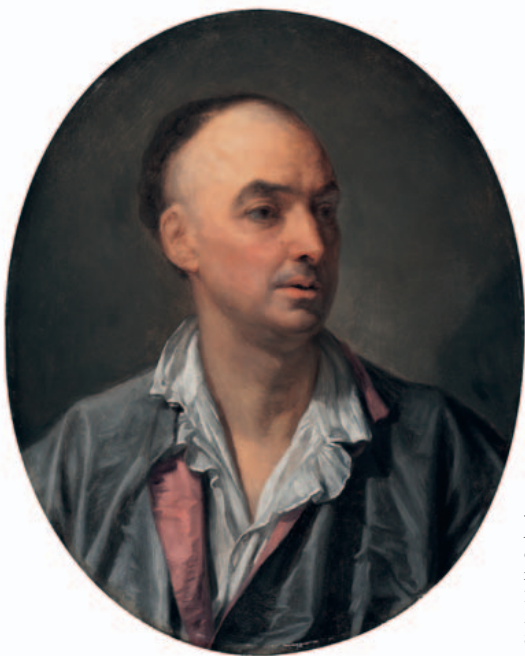
Jean-Baptiste Greuze, Portrait of Denis Diderot , ca. 1760–67. Oil on canvas, 23 3/8 x 19 1/4 inches (60 x 48.6 cm). The Menil Collection, Houston, Gift of Michael Zilkha in honor of Louisa Stude Sarofim.

All manner of personalities populate the exhibition. Tuymans’s portraits include identifiable figures such as former Secretary of State Condoleezza Rice ( The Secretary of State , 2005), Belgian nationalist writer Ernest Claes ( A Flemish Intellectual , 1995), and American white supremacist Joseph Milteer ( The Heritage VI , 1996). But he also paints anonymous individuals taken from images in medical textbooks, forensic photographs, and ads in sex magazines. The figures in Tuymans’s