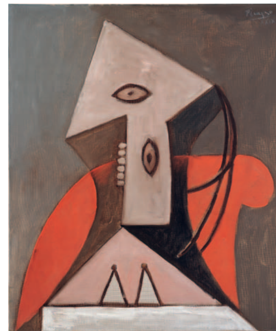
Pablo Picasso, Femme au fauteuil rouge ( Woman in a Red Armchair ), 1929. Oil on canvas, 25 3/8 x 21 1/4 inches (65 x 54 cm). The Menil Collection, Houston. © 2013 Estate of Pablo Picasso/Artists Rights Society (ARS), New York.

to make a kind of “abstraction of the visual” that cannot be entirely formulated in words. His complex and ambitious “reality check” is perhaps best summarized in the exhibition’s ambivalent, potentially sarcastic title. On one hand, the project is a sincere evaluation of the considerable charitable and cultural works of museum founders John and Dominique de Menil. On the other, it is a provocative critique of their efforts—which can be seen as enlightened and generous, high-minded and elitist, or perhaps both—to unify works of art from around the world within a physical space and intellectual framework reflecting their idealistic humanist philosophy. It is in the spirit of Anton Chekov—who described the role of the artist as being to formulate the problem correctly not (necessarily) to provide the solution—that Tuymans raises these issues. He doesn’t give us any easy answers. Instead, he leaves it to the viewer to engage the artistic and intellectual challenges posed by Nice .