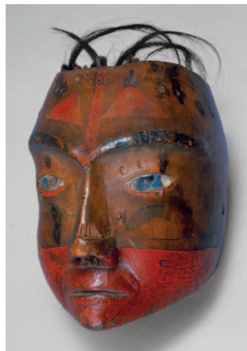
Head, Nuu-chah-nulth, west coast of Vancouver Island, British Columbia. Wood with paint, shell, and human hair, 6 1/4 x 5 3/8 x 4 3/4 inches (15.9 x 13.7 x 12.1 cm). Rock Foundation, New York.

Certainly, relatively few of the personalities depicted in Nice seem to be enjoying the mythical “nice day” so often wished upon residents of Texas and the United States. Instead, the exhibition’s anti-pantheon of faces serves as a multivalent memento mori. In Nice , Tuymans attempts