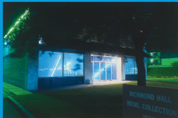
Exterior of Richmond Hall

Flavin appreciated the aesthetic of the Constructivists but did not share their utopian vision. By placing the titles of his monuments in quotation marks, the artist emphasized that he intended them to be understood ironically. Built of mass-produced fluorescent tubes that can be switched on and off, they are temporary memorials only as timeless as the light fixtures themselves. Though this tongue-in-cheek treatment refutes the idealism of the Constructivist's utterly serious endeavor, Flavin's light reliefs remain a sincere tribute to Tatlin's "frustrated, insistent attitude to attempt to combine artistry and engineering." (Flavin, "monuments" for V. Tatlin from Dan Flavin, 1964–1982 , 1989)