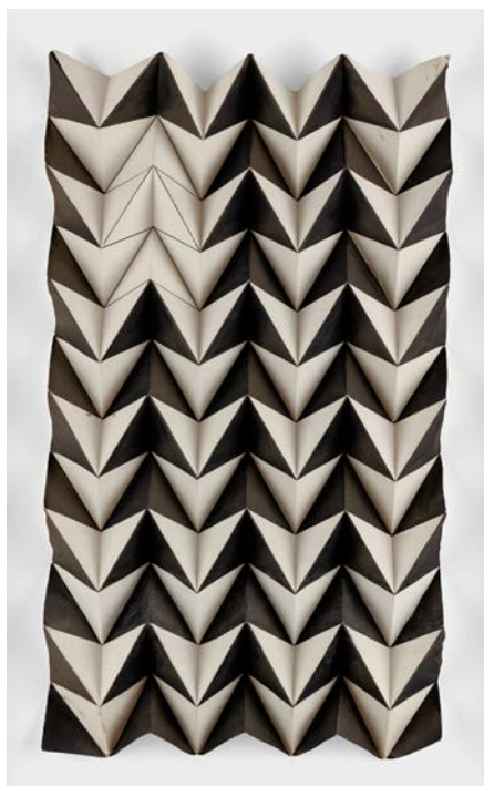
RIGHT Untitled (S.840, Mounted Paperfold of Alternating Columns of White and Black Triangles), ca. 1952. Ink on paper, 20 \frac{3}{8} × 11 × 1 \frac{1}{8} in. (51.8 × 29.2 × 2.9 cm). Private collection.