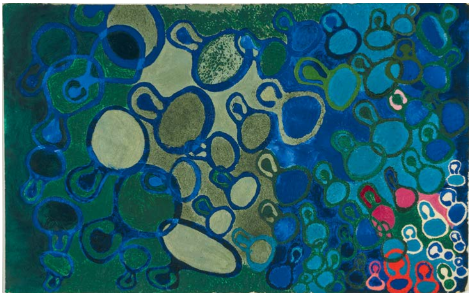
ABOVE Untitled (BMC.56, Dancers), ca. 1948–49. Oil and gouache on paper, 12 × 19 in. (30.5 × 48.3 cm). Private collection.